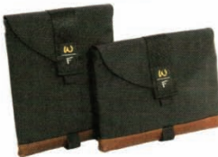
Best Style: iPad Exo SleeveCase $49-$99, sfbags.com

A bag is for iPad owners who want to carry accessories and other personal items with their iPad. Bags come in many styles, colors, sizes, and prices. Here are my choices for the Best Bag category: